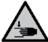
Warning crushing of hands