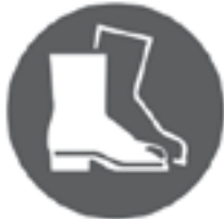
Wear protective footwear