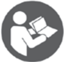
Read the instructions