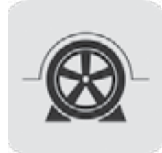
Use wheel chocks