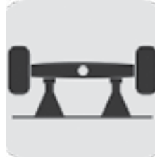
Use axle stands