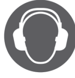
Wear Ear Protection