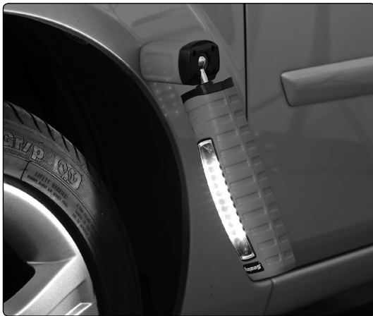
360° Swivel and tilt function. Base magnet